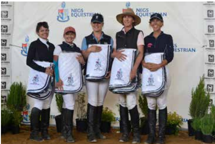
FOG Team (Fabulous Old Girls)