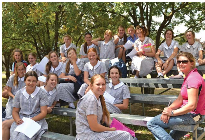
Outdoor learning at the NEGS Equestrian Centre.

Keep your eye out for an overview of results in our next issue of Akaroa.