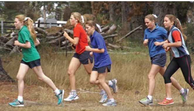
AKAROA Semester One 2015