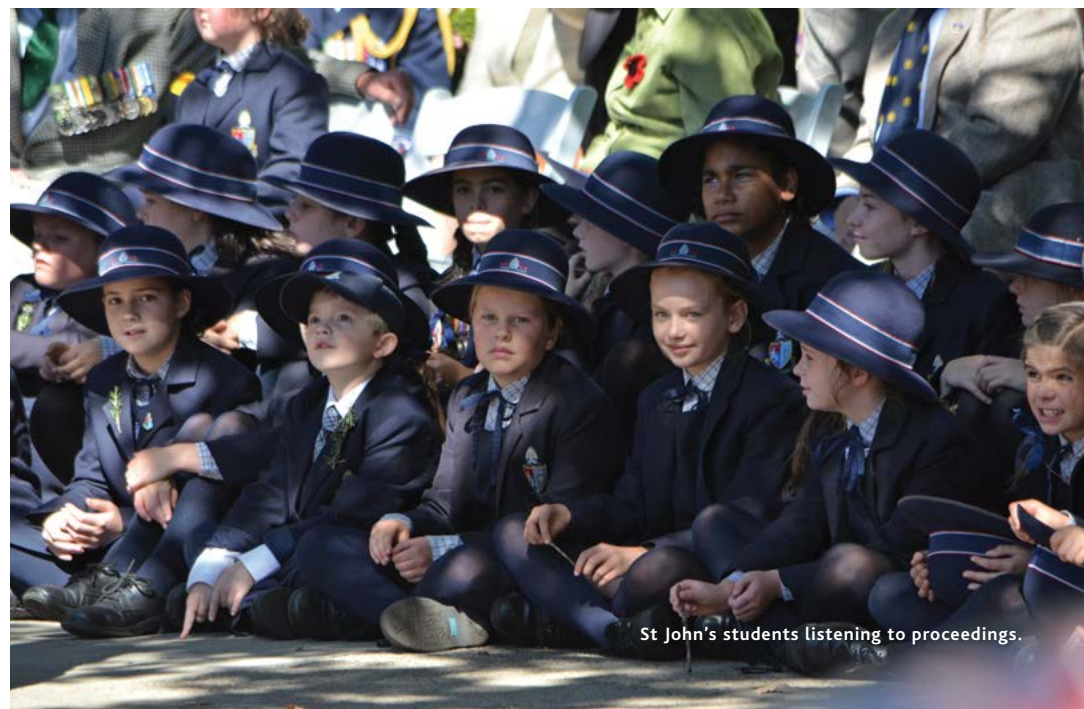
St John's students listening to proceedings.