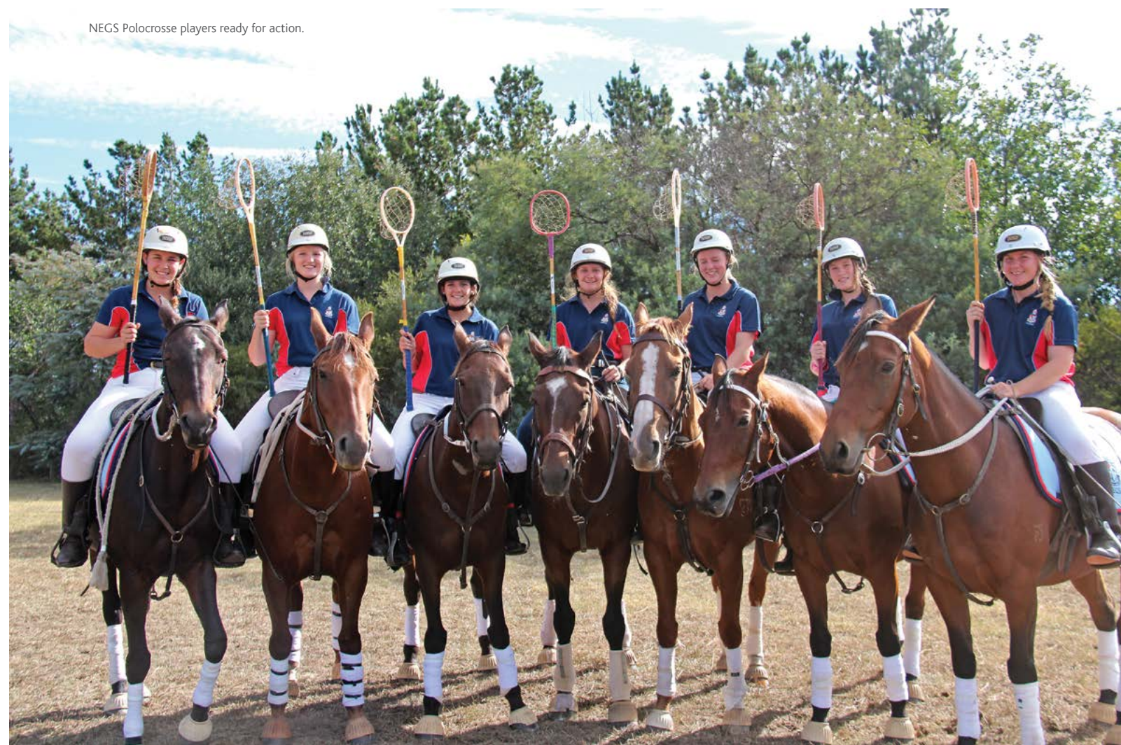
NEGS Polocrosse players ready for action.