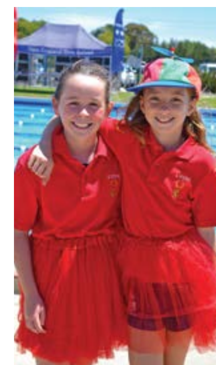
Showing support for Lyon at swimming carnival