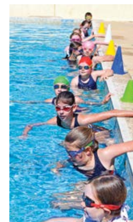
Swimmers at the triathlon