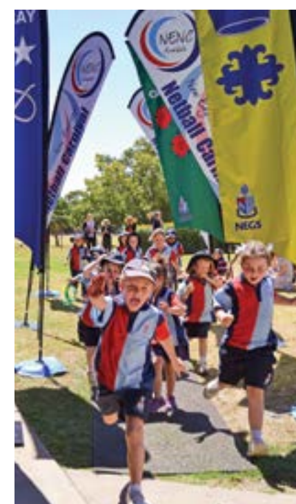
Our younger athletes