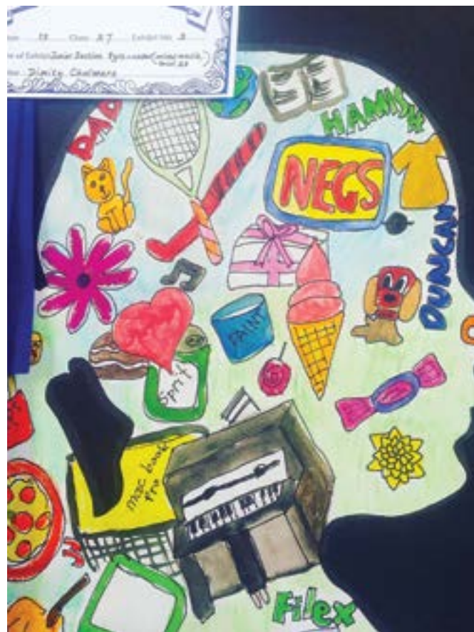
Some artworks by our talented Junior School students