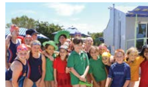
St John's swimming stars