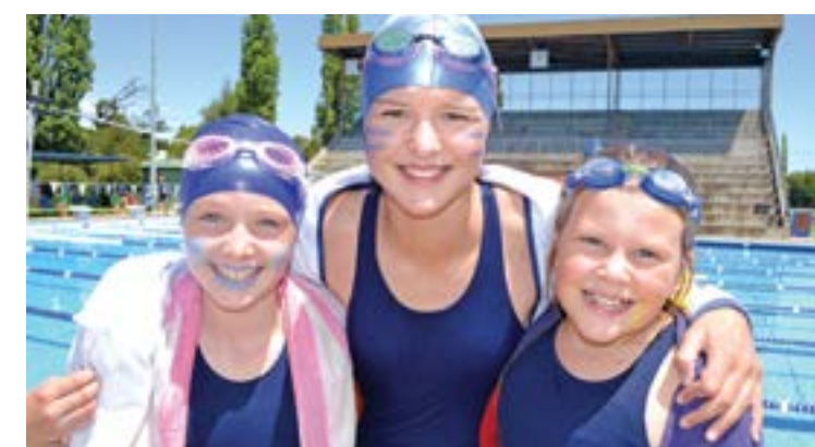
Murray competitors at the swimming carnival