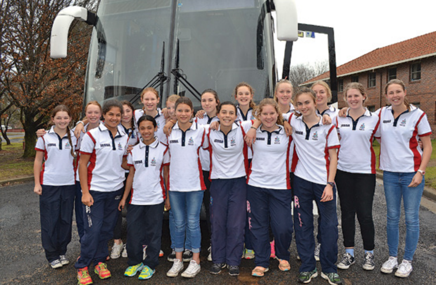
Students heading to Sydney in their new IGSSA training shirts.