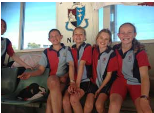
Snr girls relay - 6th in their heat