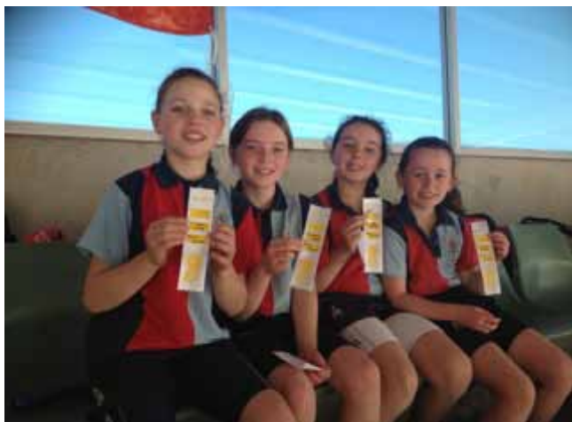
Jnr girls 4th in their relay.

St John's IPSHA Athletics @ Sydney Olympic Park - well done to all our competitors