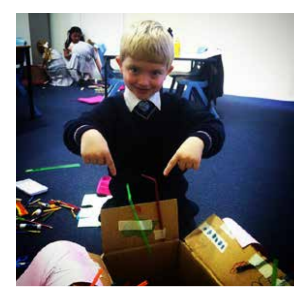
"These are the exhaust pipes. They help the car go really fast!"