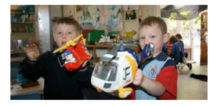
Students are asked to bring a donation for the Westpac Rescue Helicopter Service on Friday.

The helicopter will be landing on our school oval and students will be given a tour of the chopper by the pilots!!! Well done everyone who made helicopters and learnt about the amazing work of this organisation last year. Our submission was particularly good because of the amazing creativity of Transition. Well done everybody!