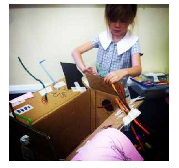
"I'm sticking on foil at the front so it looks like a windscreen. A real windscreen."