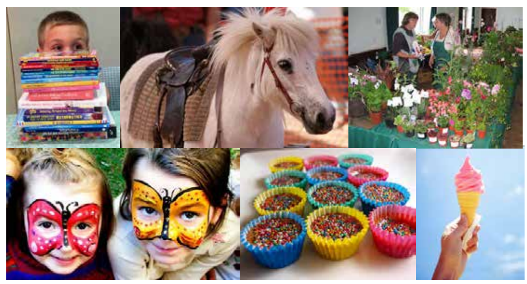
Emporium with over 20 stalls / Annual Art Show / Old Girls' Weekend

pony rides / paint a pony / wine wheel barrow/ tombola / lob-a-choc / face painting, hair & tattoos / books & craft / gourmet BBQ & relishes / cakes / nachos / drinks / ice cream / plants / balloon guessing / Concepts of Armidale fashion parade / chocolate wheel /novelty events / musical performances