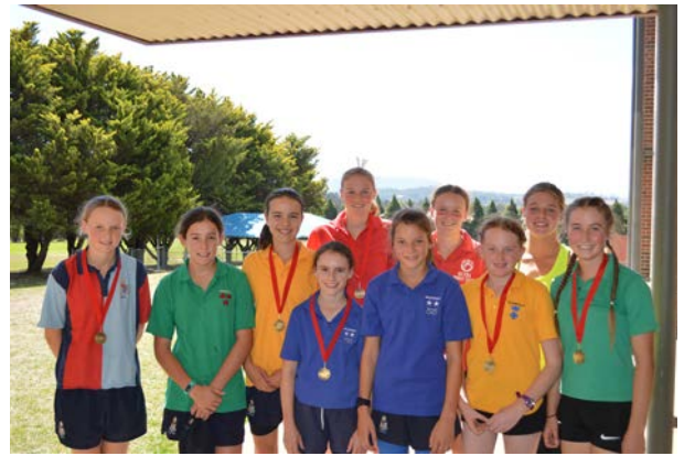
NEGS Cross Country Champions and Runners Up