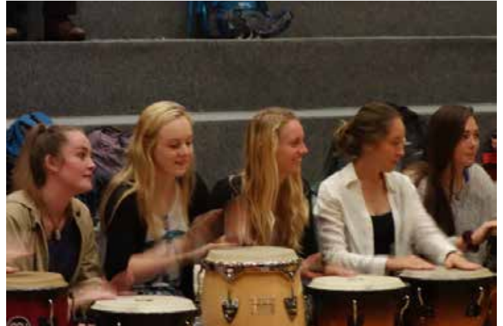
Learning Turkish Drumming.