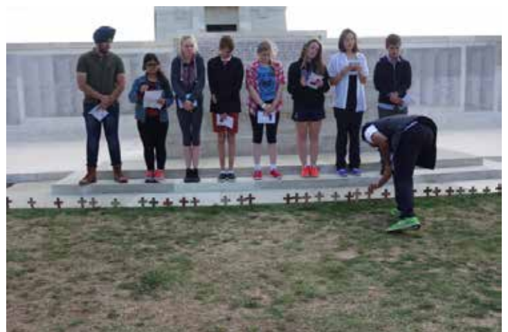
Students from each of the 7 participating schools (including Vivek High School in India) undertook a memorial service at Lone Pine and all students placed crosses brought from the Australian War Memorial.