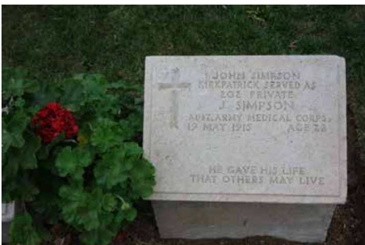
We found the grave of John Simpson from the Simpson and his Donkey fame and we surpassed to learn he only lived 20 days once he landed in Gallipoli.