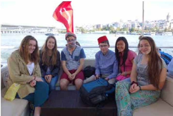
Joining students from TAS Armidale, Trinity Anglican School, Cairns and Bunbury Cathedral Grammar School in WA on a tour of the Golden Horn. Students learnt that Istanbul sits astrid a river which divides the land mass into Europe and Asia.