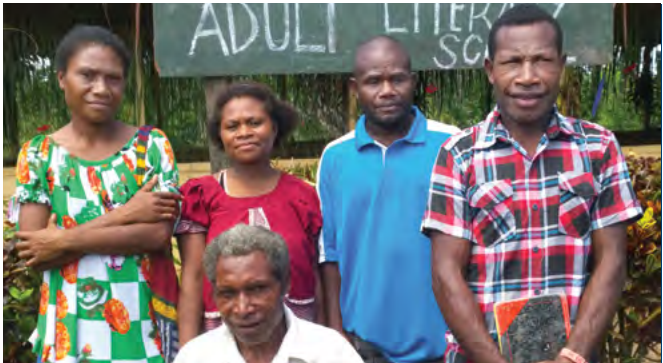
Teachers at the opening of the Mosa Adult Literacy School in New Guinea Islands Diocese in PNG