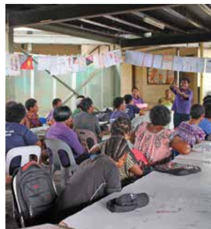
Students gather from all across Australia to participate in intensive teaching blocks. [Note the date is incorrect in the book]