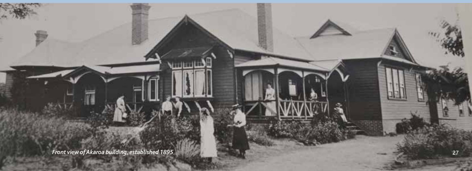
Front view of Akaroa building, established 1895