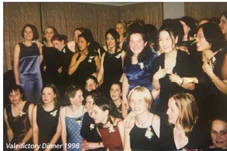
Valedictory Dinner 1998