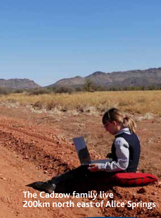
The Cadzow family live 200km north east of Alice Springs