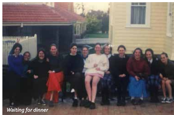
Waiting for dinner