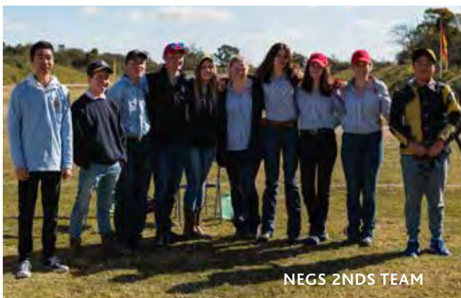
NEGS 2NDS TEAM