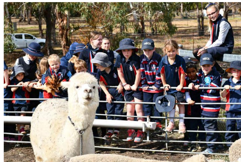
Where else can you read a story about Alpacas and then head outside and see one whilst you are at school? NEGS participated in the National Simultaneous Storytime. They listened to the story 'Alpacas with Maracas' at the same time as thousands of other students across Australia. With the assistance of the Year 8 girls, they made their own maracas and embarked on an adventure to the NEGS Agricultural farm to visit the school alpaca, "Kerry Alpaca". Our students are so fortunate to have all this at school.