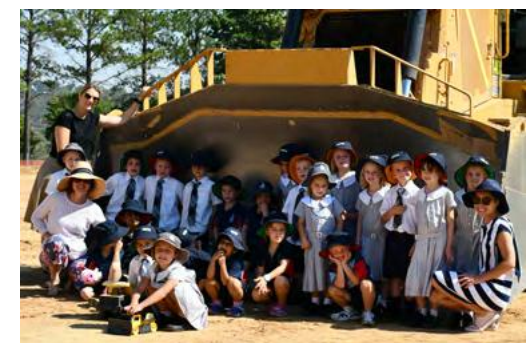
Big trucks, diggers and mounds of dirt! What a great way to start the morning for Transition and Kindergarten children! Students ventured down to the new Sporting Complex work site to check out the progress, as well as climb into the big earthmoving machinery. Thank you to the men from Ditchfield Contracting who gave up some of their busy time to show the students their machines. They loved it!