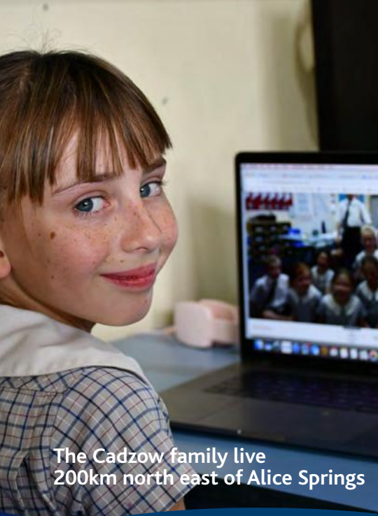
The Cadzow family live 200km north east of Alice Springs