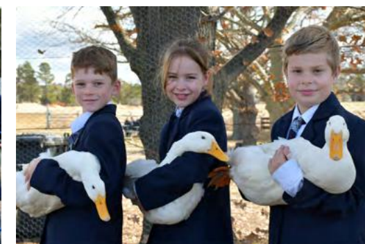
It's great having the NEGS Ag plot on campus for the Junior School children to venture down to see the pigs, ducks, chickens, sheep, alpaca and geese.