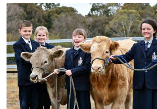
Our Junior School students love being involved in the NEGS Livestock team where they have the opportunity to participate in local shows along with the senior students.