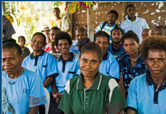
Students at the Awala Adult Literacy School in Saiho Community, Popondetta.