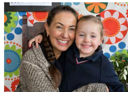
Our fabulous Transition Mums were treated to a morning of superstar performances, gifts, coffee from our Senior School NEGSpresso students and lots of love and cuddles from their children for the Transition Mothers Day Morning Tea.