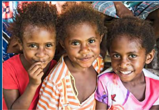
Young girls at the early childhood literacy class in Papua New Guinea.