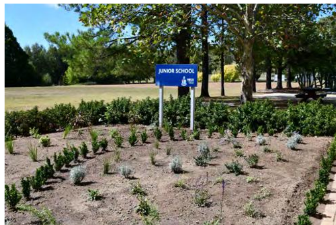
A huge thank you to the NEGS P&F for donating the plants for the garden. We look forward to watching it grow with the children.