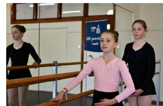
Our students get very excited on their dance lessons days and have the opportunity to learn ballet, tap, jazz and contemporary dance.